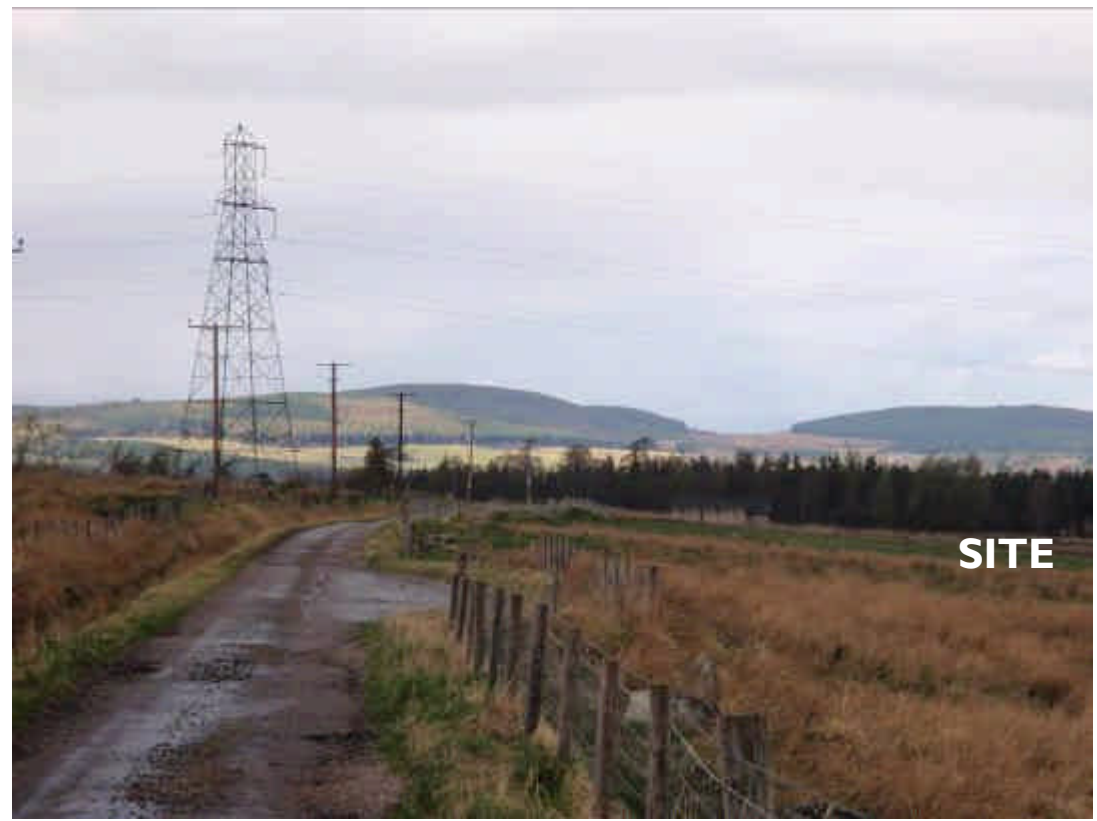
Fig. 3- View of site looking north west in direction of A95