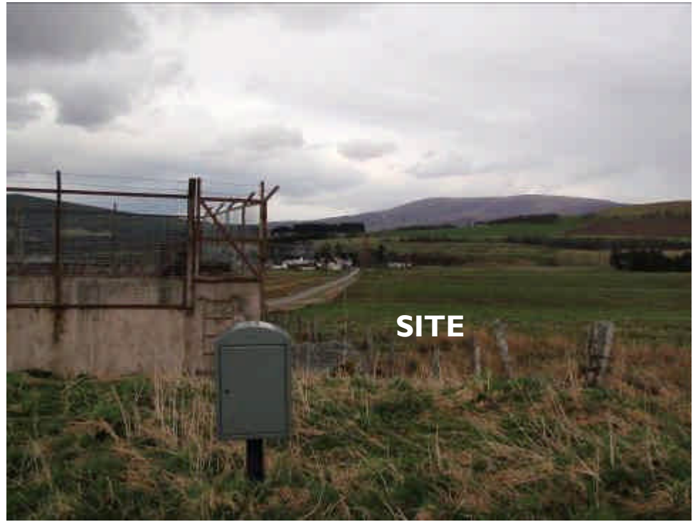
Fig. 2- View of site looking towards Balmenach