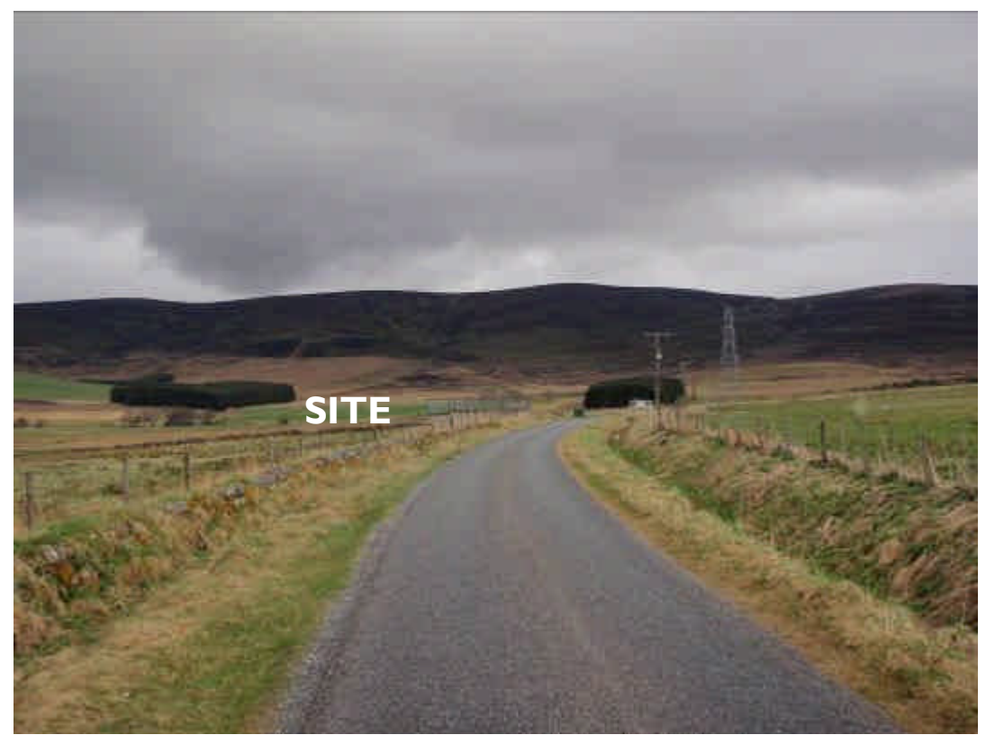
Fig. 4- View of site looking south east to Cromdale Hills