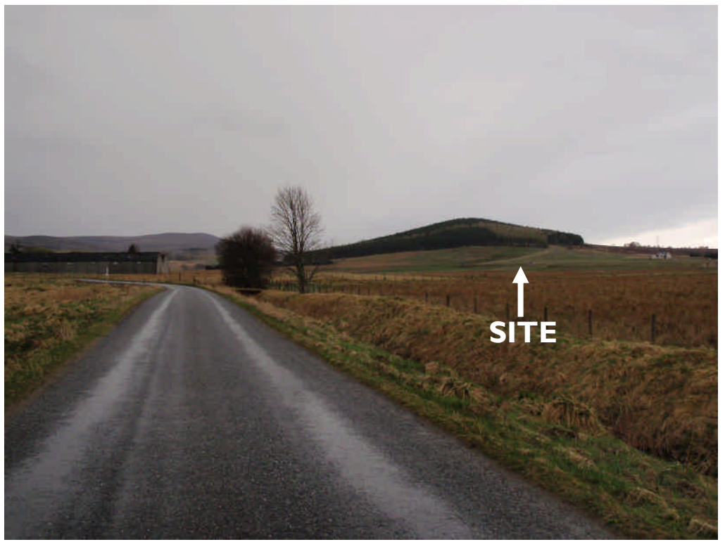
Fig.. 5 Distant view from Balmenach